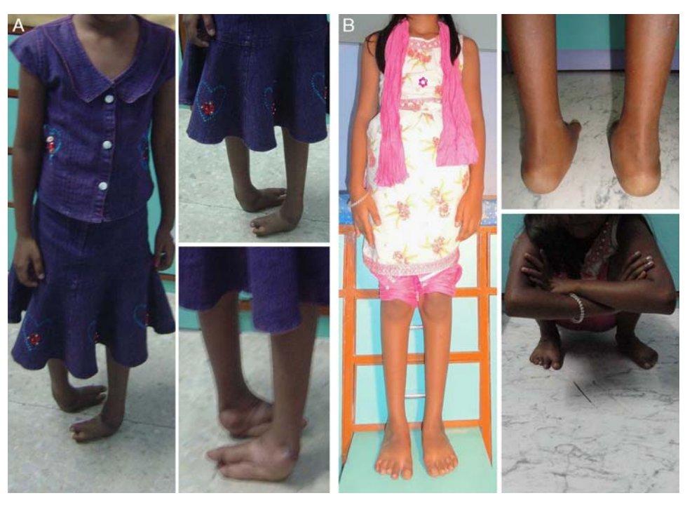
FIGURE 5. (A) Six-year-old girl with bilateral grade IV neglected clubfeet. (B) Five years after surgery with good maintenance of the hindfoot, forefoot, and midfoot correction, bilaterally. Squatting was possible. The child was able to perform all day-to-day activities without any pain.

performed squatting exercises nor used splints, leading to recurrence. This suggests that squatting has an important role to play. In spite of poor results, he maintained good function.