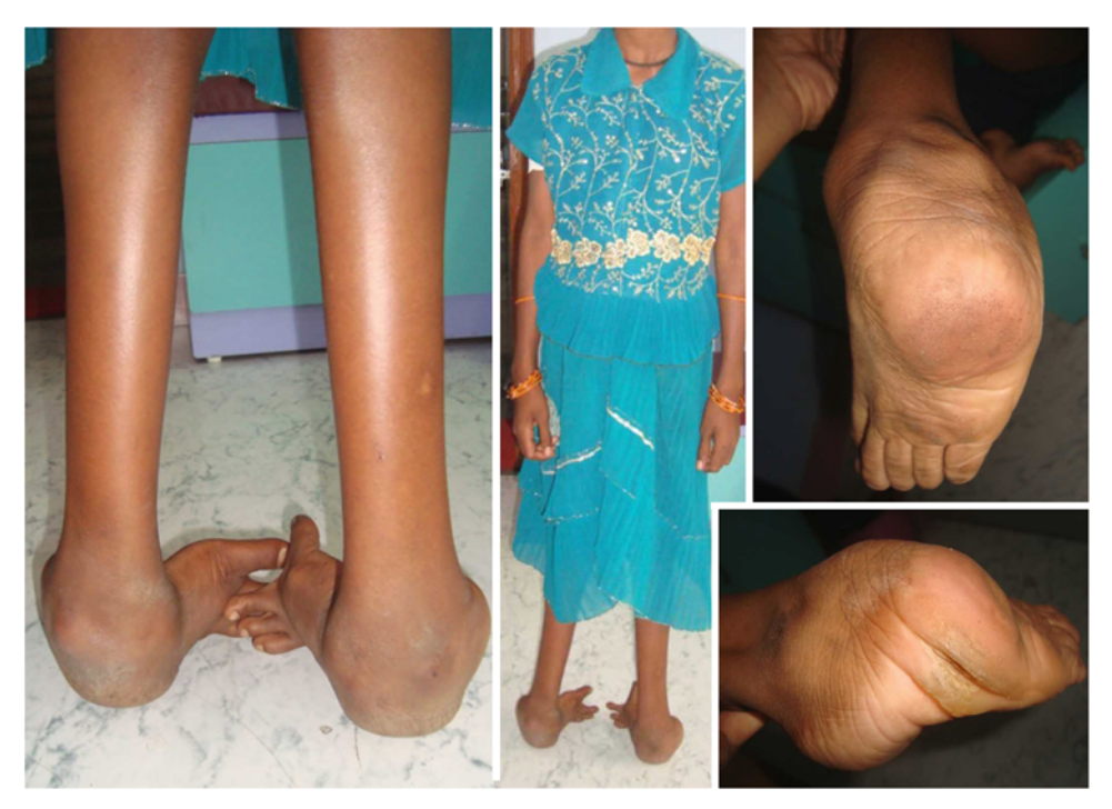
FIGURE 1. Thirteen-year-old girl with bilateral neglected clubfeet. These feet are prone to repeated injuries at callosities formed over the dorsum of the feet.

additional major procedures were required to get complete correction because of secondary deformation of bones.<sup>7,9</sup>