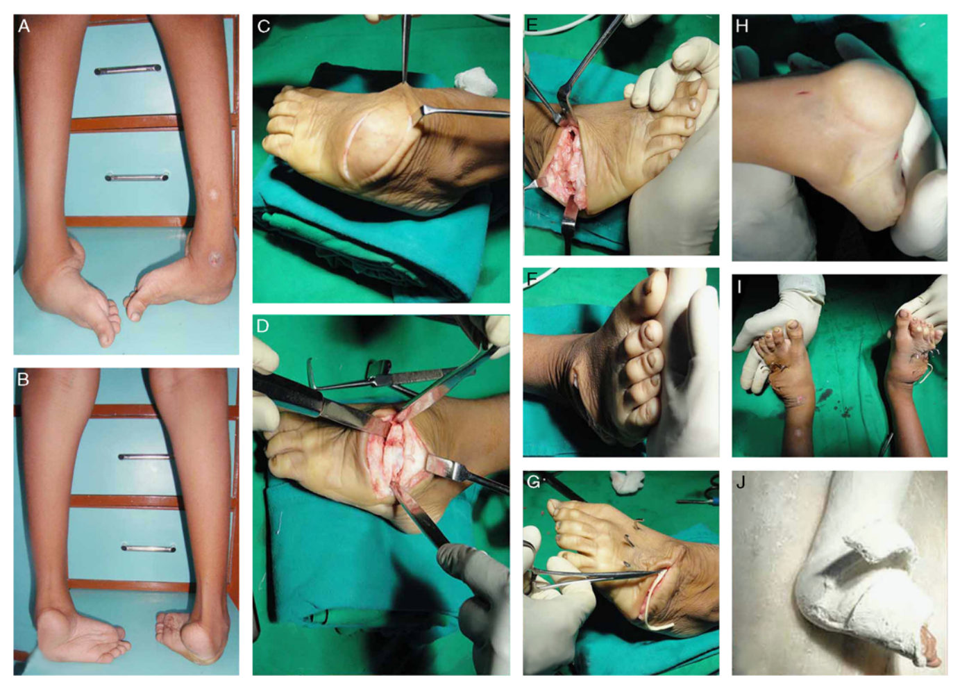
FIGURE 2. (A and B) Preoperative photograph of a 9-year-old child with bilateral neglected grade IV clubfoot deformity. The deformity is rigid and bones are severely deformed. (C) After percutaneous plantar fasciotomy and Achilles tenotomy, an elliptical skin incision is taken over dorsum of foot at apex of the deformity. (D) After preserving dorsal structures, the osteotomy is marked with osteotome at the apex of the deformed foot. The wedge is wider dorsally (1–2 cm) and tapers towards the sole. (E) Once the wedge is removed, the deformity is corrected by closing the space manually by everting and dorsiflexing the foot. (F) Bony surfaces are approximated, and the deformity is completely corrected. (G) The forefoot is stabilized to the hindfoot with three Kirschnerwires. The drain is in place. (H) Posterior view shows complete correction of equinus and heel varus. (I) Good correction of all components is achieved in both feet. (J) A window was made in the cast for inspection of the wound.